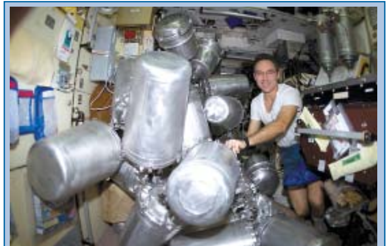
Astronaut Carl E. Walz, Expedition Four flight engineer, catalogs canisters of water in the Zvezda Service Module on the International Space Station.

tion-reverse osmosis system. The technique of rotating filtration had been applied to microfiltration, but never to reverse osmosis due to technical issues stemming from the pressures involved.